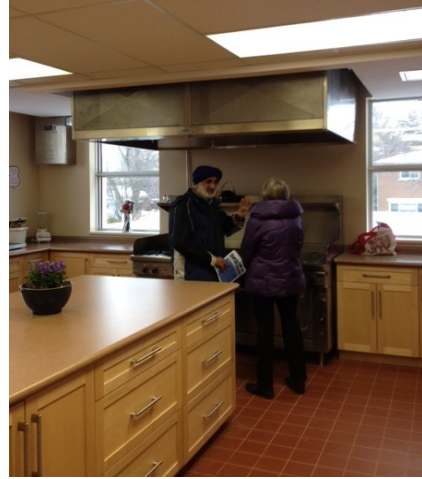
Participants admire the energy efficient range in the new kitchen at Emmanuel United Church (Smythe Rd.).