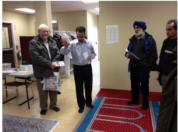
Participants learning about the sustainable building process at Masjid Bilal Mosque (Innes Rd.).

A big thanks to everyone who came on the Sustainable Buildings Bus Tour, and all our host communities. We had a great time!